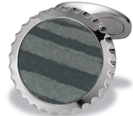
M 1866-2 750/-WG, pol. Ferrid