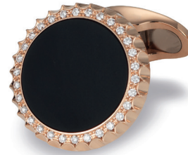
M 1866-31 750/-RG, pol. Onyx matt 60 Dia. à 0.005 ct, G, VS