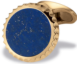
M 1866-13 750/-GG, pol. Lapis