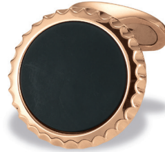
M 1866-10 750/-RG, pol. Onyx matt